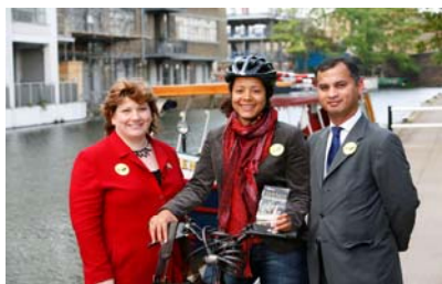
Murad launching the "Two Tings" campaign with Emily Thornberry, MP for South Islington, and a cyclist.

B ritish Waterways' improvement programme to make Regent's Canal's towpaths safer, more attractive and more accessible has led to increased use by pedestrians and cyclists. After local residents raised concerns about inconsiderate behaviour from some towpath users, British Waterways (BW) launched a 'code of conduct' encouraging cyclists to ring their bell twice when approaching a pedestrian, to pass people slowly and ride at a sensible speed. It also encourages pedestrians to listen for cyclists' bells and to allow cyclists enough room to pass.