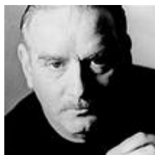
Author Peter Ackroyd's will talk about the river Thames.